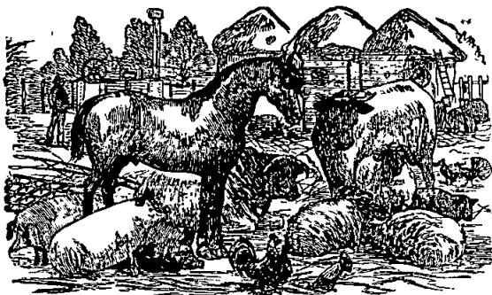
AMERICAN HORSE AND CATTLE FOOD.