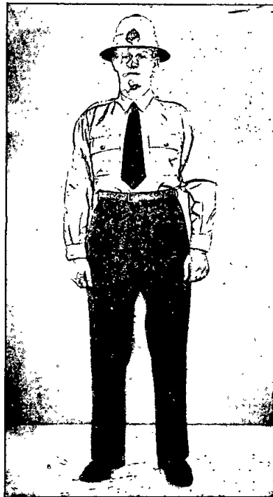
SECOND SCHEDULE. SUB-OFFICERS AND CONSTABLES (FOOT UNIFORM).

Photograph of Constable in full uniform with white helmet and badge.