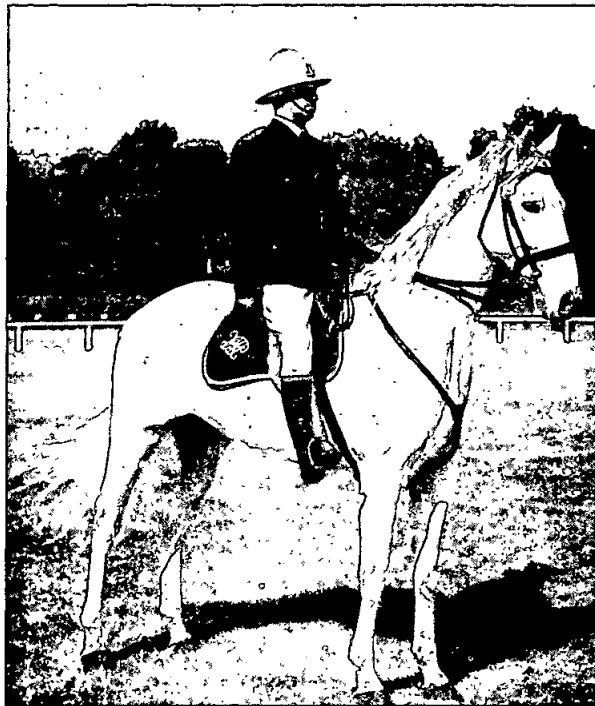
THIRD SCHEDULE. SUB-OFFICERS AND CONSTABLES (MOUNTED UNIFORM).

Photograph of Constable with tunic, khaki gabardine breeches, leggings, and cap with badge.