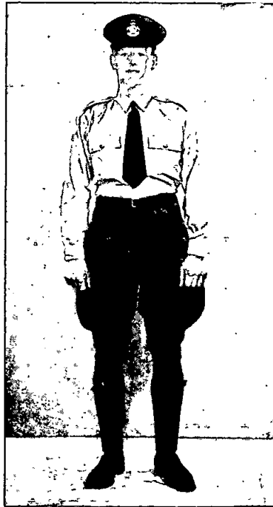
FOURTH SCHEDULE. SUB-OFFICERS AND CONSTABLES (MOBILE TRAFFIC CONTROL UNIFORM). No. 4. Photograph of Constable in tunic, khaki breeches, leggings, and cap with badge.