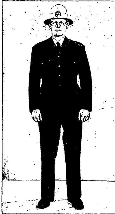
SECOND SCHEDULE. SUB-OFFICERS AND CONSTABLES (FOOT UNIFORM).