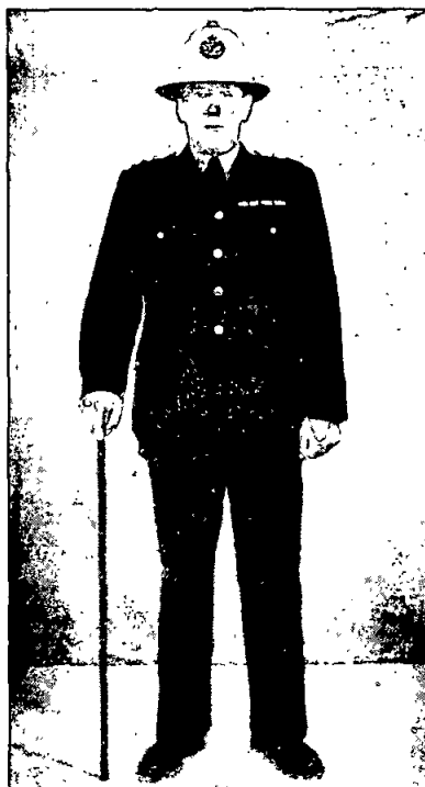
FIRST SCHEDULE. OFFICER'S UNIFORM. No. 3.

Photograph of Officer in full uniform with white helmet with badge.