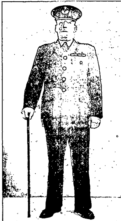
FIRST SCHEDULE. OFFICER'S UNIFORM. No. 2.

Photograph of Officer in full uniform with overcoat, cap with waterproof cover and badge.