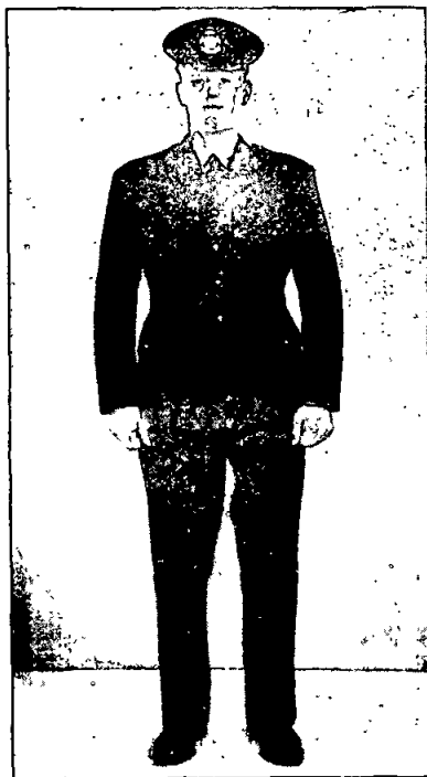
SECOND SCHEDULE. SUB-OFFICERS AND CONSTABLES (FOOT UNIFORM). No. 1.

Photograph of Officer in full uniform with white helmet with badge.