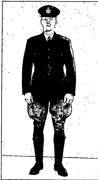
THIRD SCHEDULE. SUB-OFFICERS AND CONSTABLES (MOUNTED UNIFORM).