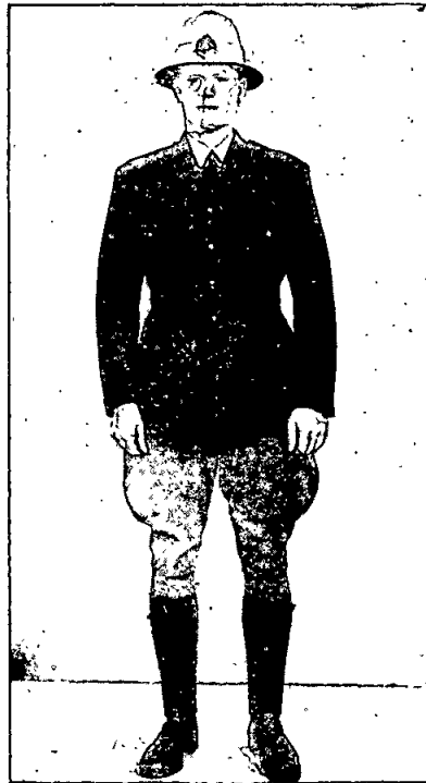
THIRD SCHEDULE. SUB-OFFICERS AND CONSTABLES (MOUNTED UNIFORM).