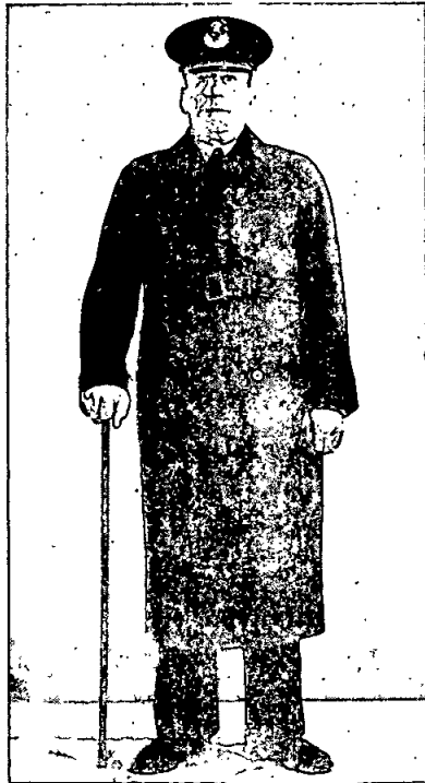
FIRST SCHEDULE. OFFICER'S UNIFORM. No. 1.

Photograph of Officer in full uniform with overcoat, cap with waterproof cover and badge.