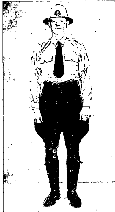
THIRD SCHEDULE. SUB-OFFICERS AND CONSTABLES (MOUNTED UNIFORM).