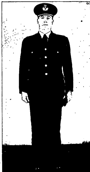
FIRST SCHEDULE. OFFICER'S UNIFORM. No. 2.

Photograph of Officer in full uniform with overcoat, gloves, cap with waterproof cover and badge.