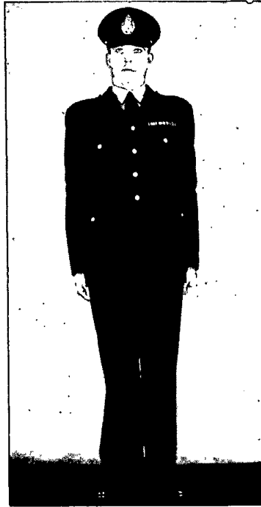
SECOND SCHEDULE. SUB-OFFICERS AND CONSTABLES (FOOT UNIFORM).