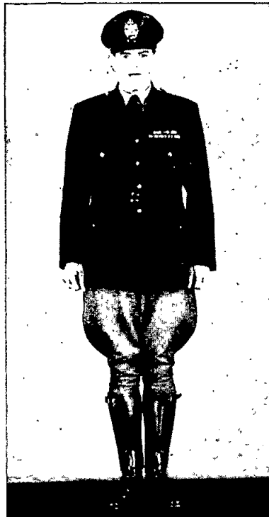
FOURTH SCHEDULE. SUB-OFFICERS AND CONSTABLES (MOBILE TRAFFIC SECTION, MEMBERS OF THE FORCE PERFORMING MOTOR CYCLE OR MOTOR CAR DUTY AND MOTOR TESTING POLICE UNIFORM).

Photograph of Constable with uniform shirt, belted trousers, and helmet with badge.