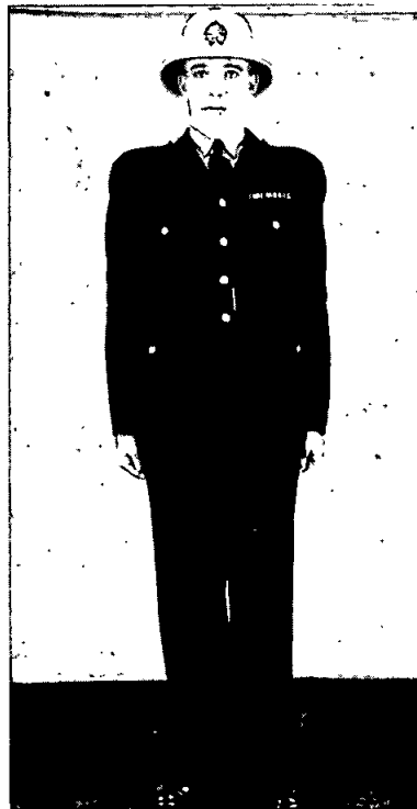
SECOND SCHEDULE. SUB-OFFICERS AND CONSTABLES (FOOT UNIFORM).

Photograph of Constable in full uniform with cap and badge.