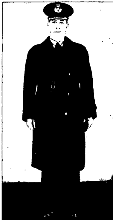
FIRST SCHEDULE. OFFICER'S UNIFORM. No. 1.

Photograph of Officer in full uniform with overcoat, gloves, cap with waterproof cover and badge.