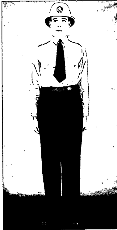
SECOND SCHEDULE. SUB-OFFICERS AND CONSTABLES (FOOT UNIFORM).