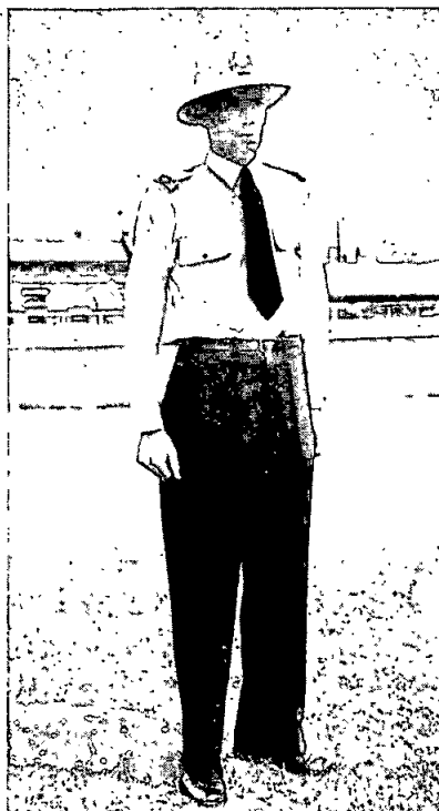
SECOND SCHEDULE. SUB-OFFICERS AND CONSTABLES (FOOT UNIFORM). No. 5. Photograph of Constable with uniform shirt, belted trousers, white helmet and badge.