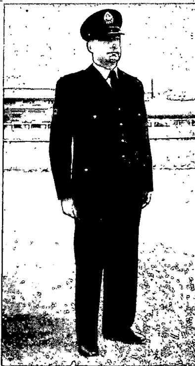
SECOND SCHEDULE. SUB-OFFICERS AND CONSTABLES (FOOT UNIFORM). No. 3. Photograph of Sergeant in full uniform with cap and badge.