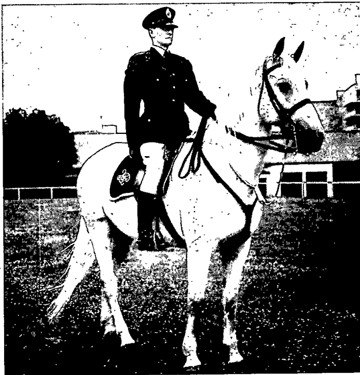
THIRD SCHEDULE. SUB-OFFICERS AND CONSTABLES (MOUNTED UNIFORM). No. 2.

Photograph of Constable (Mounted) with tunic, riding breeches, riding boots, cap and badge.