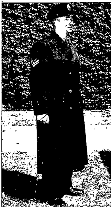
SECOND SCHEDULE. SUB-OFFICERS AND CONSTABLES (FOOT UNIFORM). No. 2. Photograph of Senior Constable in full uniform with overcoat (gabardine), cap and badge.