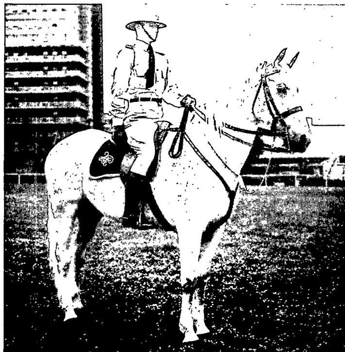
THIRD SCHEDULE. SUB-OFFICERS AND CONSTABLES (MOUNTED UNIFORM). No. 7.

Photograph of Constable (Mounted) with uniform shirt, khaki breeches, leggings, white helmet and badge.