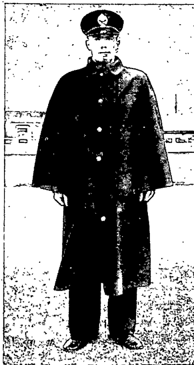
SECOND SCHEDULE. SUB-OFFICERS AND CONSTABLES (FOOT UNIFORM). No. 1. Photograph of Constable in full uniform with overcoat (cape style), cap and badge.