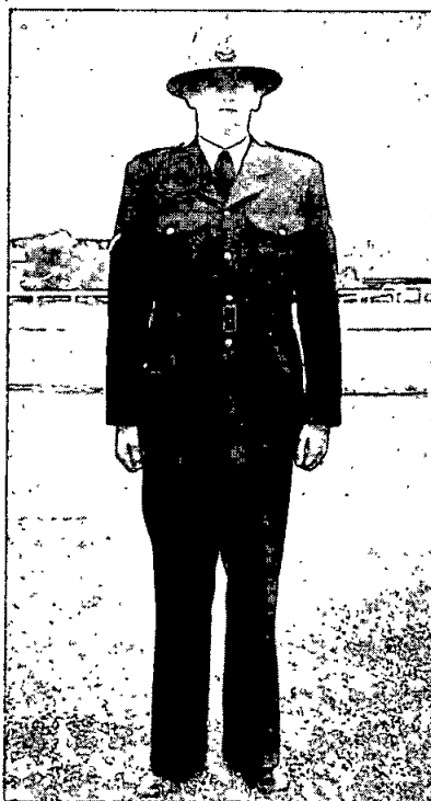
SECOND SCHEDULE. SUB-OFFICERS AND CONSTABLES (FOOT UNIFORM). No. 4. Photograph of First Constable in full uniform with white helmet and badge.