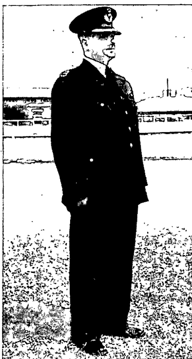
FIRST SCHEDULE. OFFICER'S UNIFORM.

Photograph of Officer in full uniform with overcoat, gloves, cap and badge.