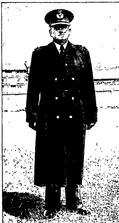
FIRST SCHEDULE. OFFICER'S UNIFORM.