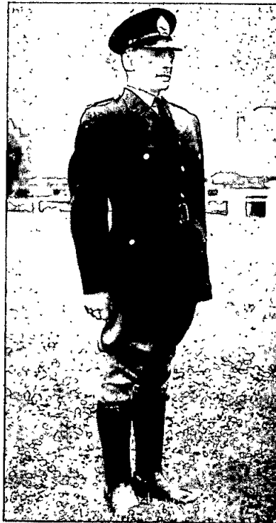
THIRD SCHEDULE. SUB-OFFICERS AND CONSTABLES (MOUNTED UNIFORM).