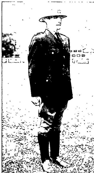
THIRD SCHEDULE. SUB-OFFICERS AND CONSTABLES (MOUNTED UNIFORM).

Photograph of Constable with tunic, khaki breeches, leggings, cap and badge.