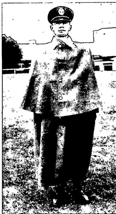
THIRD SCHEDULE. SUB-OFFICERS AND CONSTABLES (MOUNTED UNIFORM). No. 1. Photograph of Constable in full uniform with cloak, gloves and cap.