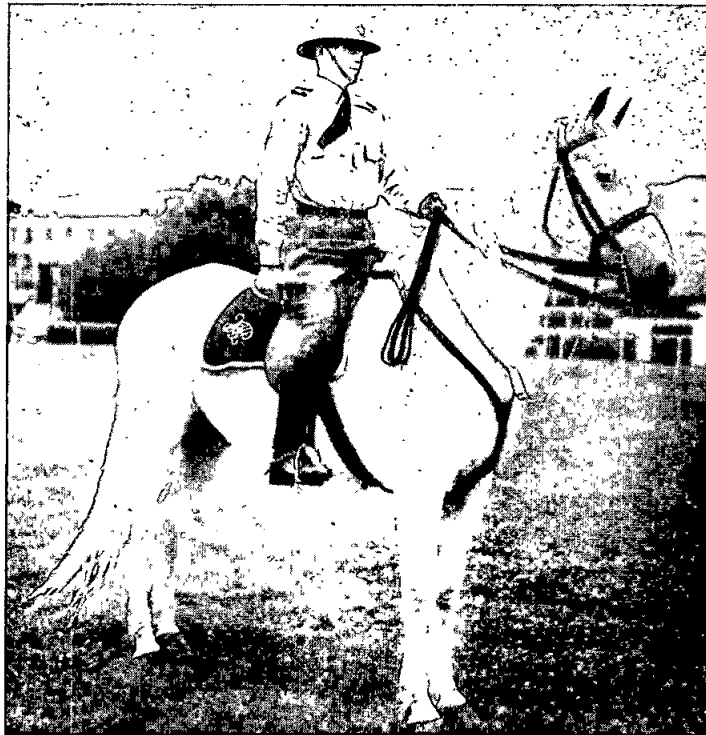
THIRD SCHEDULE. SUB-OFFICERS AND CONSTABLES (MOUNTED UNIFORM). No. 6.

Photograph of Constable (Mounted) with uniform shirt, khaki breeches, leggings, white helmet and badge.