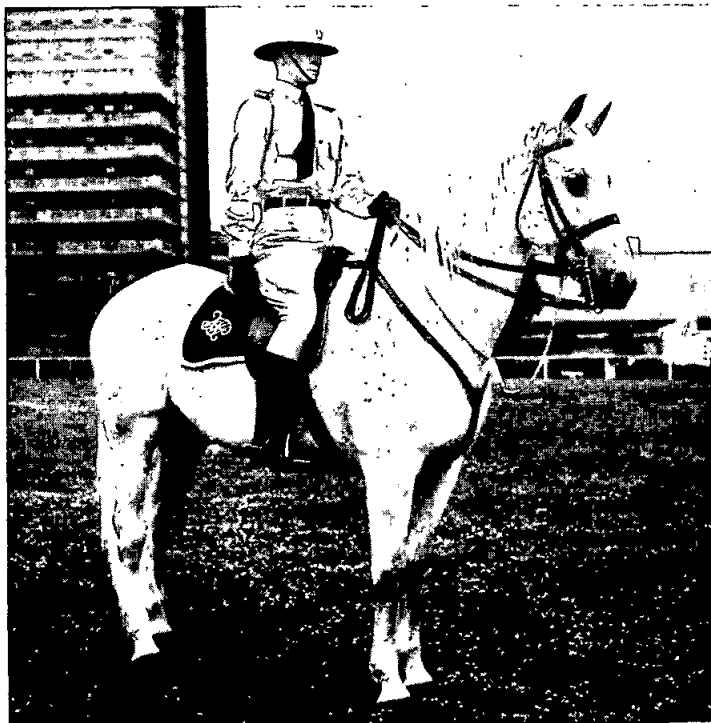
THIRD SCHEDULE. SUB-OFFICERS AND CONSTABLES (MOUNTED UNIFORM). No. 7.

Photograph of Constable (Mounted) with uniform shirt, khaki breeches, leggings, white helmet and badge.