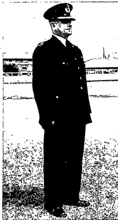
FIRST SCHEDULE. OFFICER'S UNIFORM. No. 2.

Photograph of Officer in full uniform with overcoat, gloves, cap and badge.