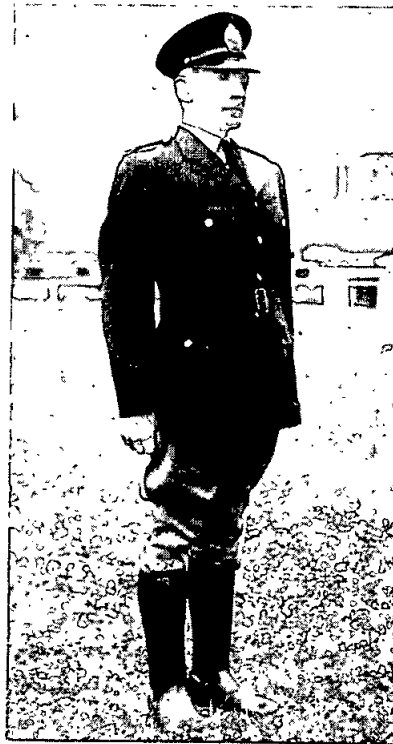
THIRD SCHEDULE. SUB-OFFICERS AND CONSTABLES (MOUNTED UNIFORM).