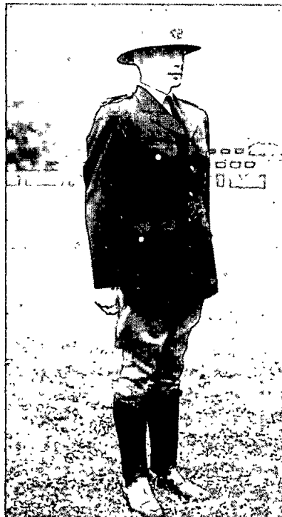
THIRD SCHEDULE. SUB-OFFICERS AND CONSTABLES (MOUNTED UNIFORM).

Photograph of Constable with tunic, khaki breeches, leggings, cap and badge.