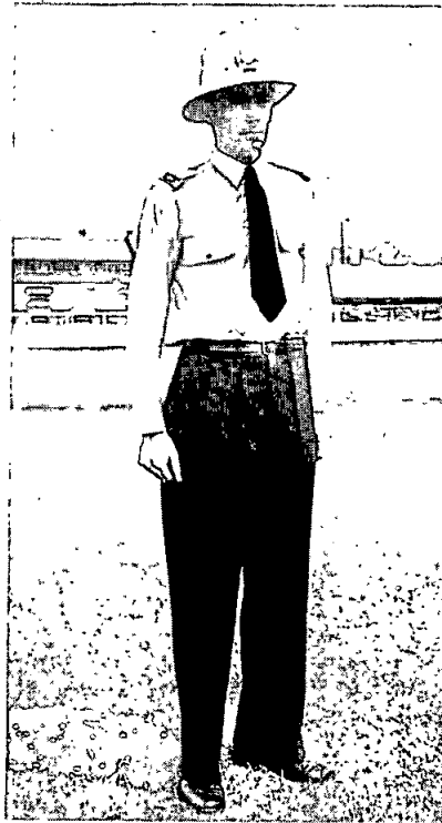
SECOND SCHEDULE. SUB-OFFICERS AND CONSTABLES (FOOT UNIFORM). No. 5.

Photograph of Constable with uniform shirt, belted trousers, white helmet and badge.