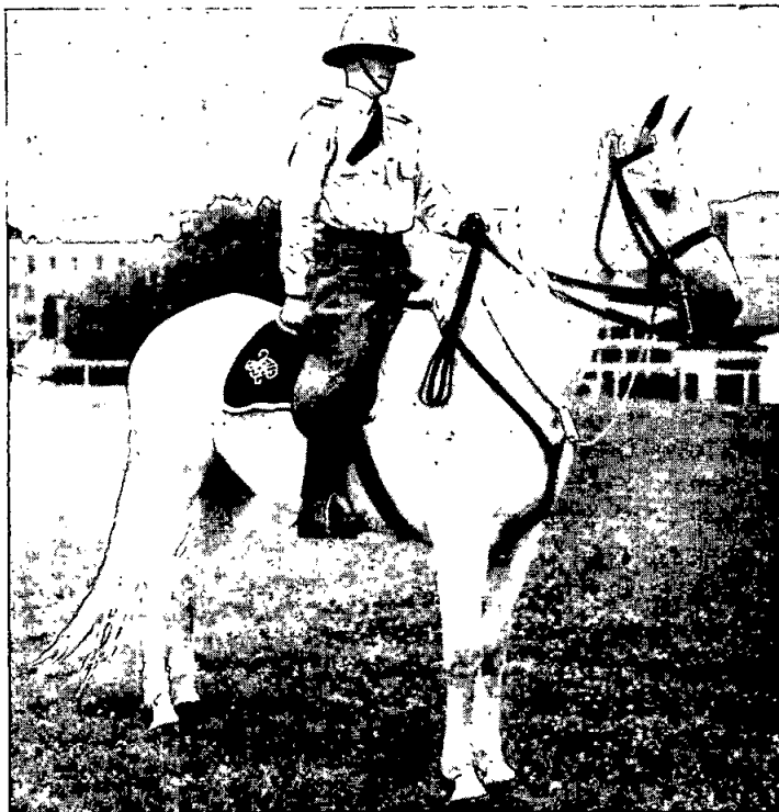
THIRD SCHEDULE. SUB-OFFICERS AND CONSTABLES (MOUNTED UNIFORM). No. 6.

Photograph of Constable (Mounted) with uniform shirt, khaki breeches, leggings, white helmet and badge.