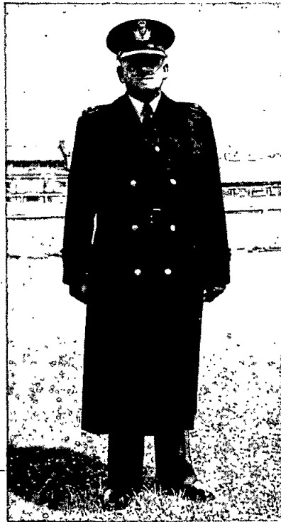
FIRST SCHEDULE. OFFICER'S UNIFORM. No. 1.

Photograph of Officer in full uniform with overcoat, gloves, cap and badge.