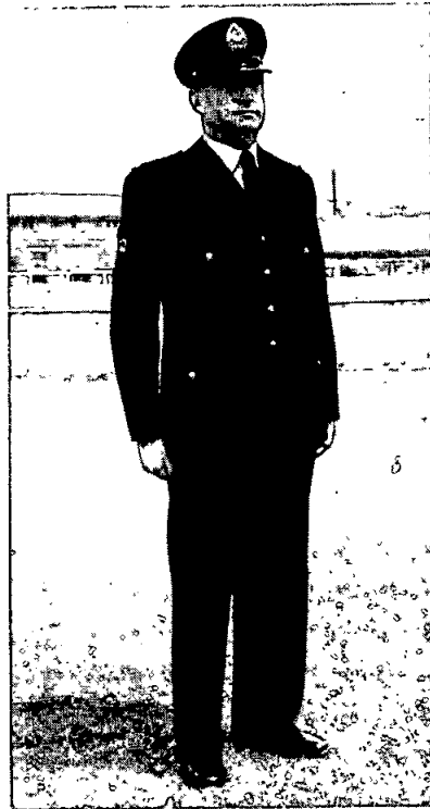
SECOND SCHEDULE. SUB-OFFICERS AND CONSTABLES (FOOT UNIFORM).