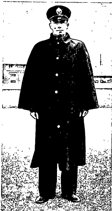
SECOND SCHEDULE. SUB-OFFICERS AND CONSTABLES (FOOT UNIFORM). No. 1.

Photograph of Constable in full uniform with overcoat (cape style), cap and badge.