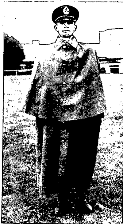
THIRD SCHEDULE. SUB-OFFICERS AND CONSTABLES (MOUNTED UNIFORM). No. 1.

Photograph of Constable with uniform shirt, belted trousers, white helmet and badge.