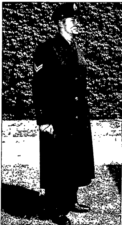
SECOND SCHEDULE. SUB-OFFICERS AND CONSTABLES (FOOT UNIFORM). No. 2.

Photograph of Constable in full uniform with overcoat (cape style), cap and badge.