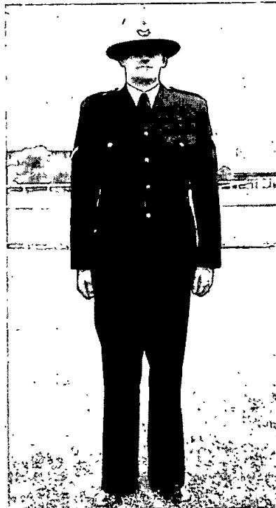
SECOND SCHEDULE. SUB-OFFICERS AND CONSTABLES (FOOT UNIFORM).

Photograph of Sergeant in full uniform with cap and badge.